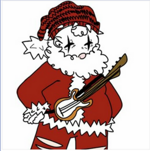
Tell your face it's Christmas, by CFO Activity Hub in Manchester with TiPP